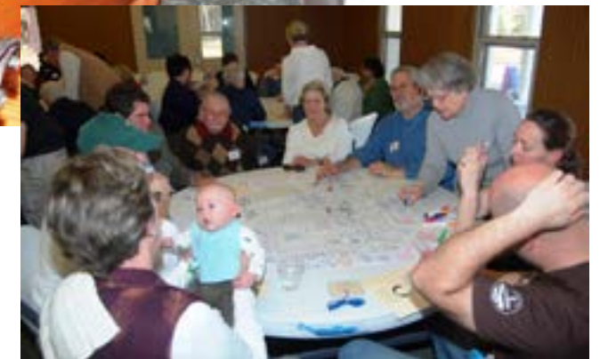
All ages participated!