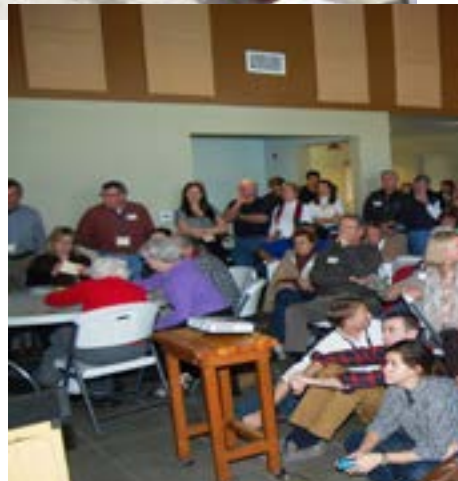
Villa Marie was filled to capacity for the beginning of the Design Charrette on Founders' Day