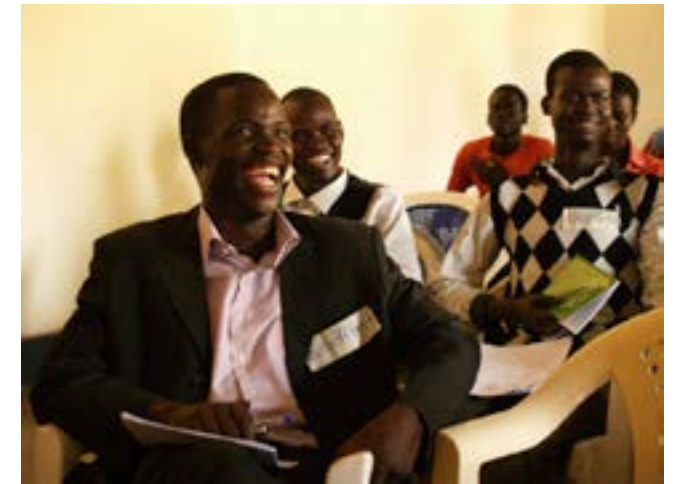
Kitgum GAT Participants Learn and Laugh

The Lord is mending the hearts and lives of people in war-torn Kitgum in northern Uganda and using Global Alpha Training to build eleven teams to launch Alpha in their congregations.