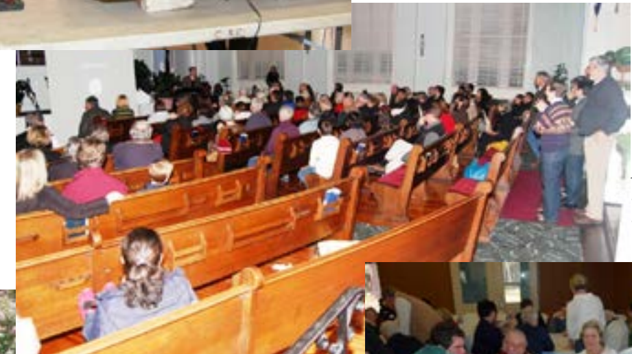
A good crowd attended the Presentation at the Christian Revival Center.