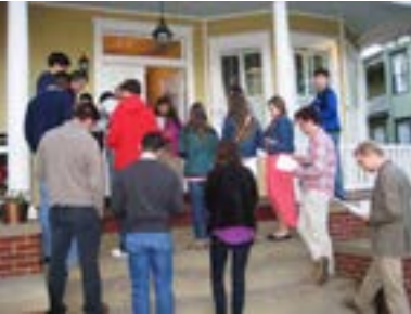
Youth gather to give gifts and share in the House Blessing at the Copetillo Home.